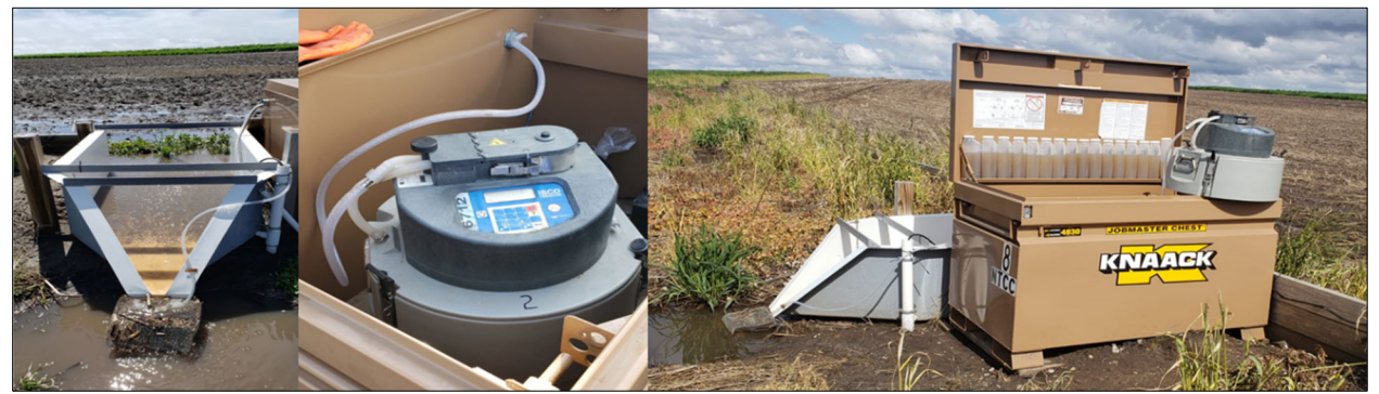
Figure 2. H-flumes and equipment used in the study to measure and sample runoff.

The equipment to receive and measure and sample runoff for each watershed was bought during 2014. The equipment included 0.46-m H-flumes to receive runoff and ISCO 6712 autosamplers with appropriate electronic hardware and software. The equipment installation was finished in March 2015 when soils thawed. Therefore, runoff collection began in spring 2015 before the first-year rye cover crop was terminated, the tillage systems had been in place for one year, and before corn was planted. The automatic runoff sampler was equipped with one liter 24 bottles programed to take a 300-ml sample to each bottle after every one-cubic meter of runoff (Fig. 2).